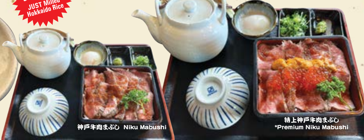
神戸牛肉まぶし Niku Mabushi