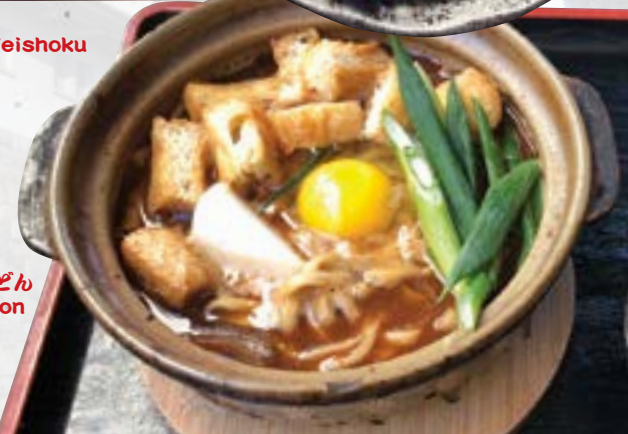
味噌煮込みうどん Misonikomi Udon

Udon noodles served in a hearty red miso based thick soup w/ poached egg, chicken, fried tofu, fish cake, green onions, & shiitake mushrooms. Served in individual earthen hot pot