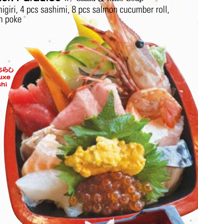
特上ちりし Deluxe Premium Chirashi

4 pcs nigiri, 4 pcs sashimi, 8 pcs salmon cucumber roll, salmon poke