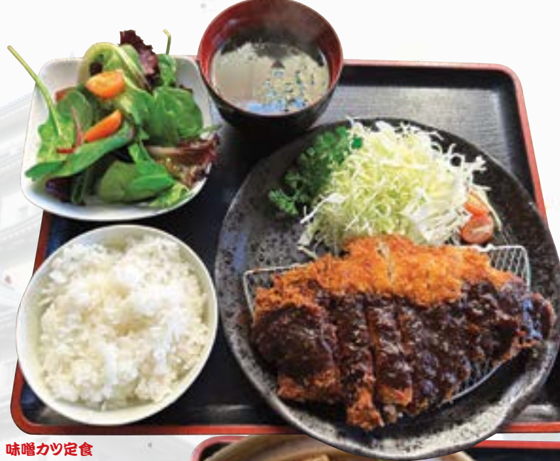
味噌カツ定食 Misokatsu Teishoku

Fried pork-loin topped w/ thick sweet red miso