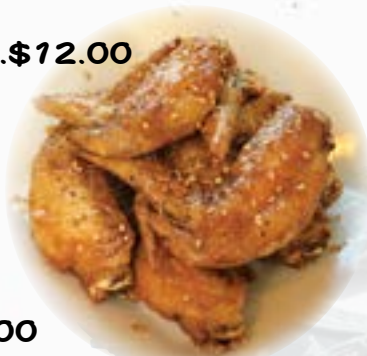
名古屋手羽地鶏 Nagoya Style Jidori Chicken Wings

Fried chicken wings tossed in special sauce, sesame seeds & black pepper.