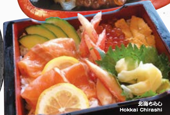
北海道ちりし Hokkai Chirashi