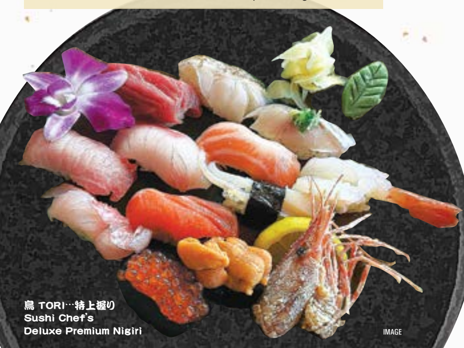
鳥 TORI...特上握り Sushi Chef's Deluxe Premium Nigiri