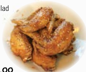
名古屋手羽地鶏 Nagoya Style Jidori Chicken Wings