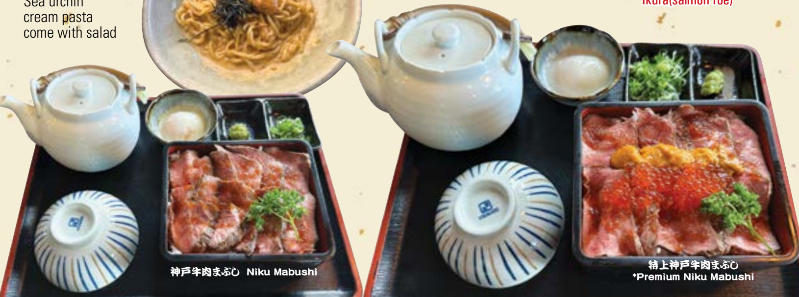
神戸牛肉まぶし Niku Mabushi

10pcs KOBE roast beef on top of rice, come with poached egg & dashi(fish broth) *Premium Niku Mabushi.....Uni(sea urchin) & Ikura(salmon roe)